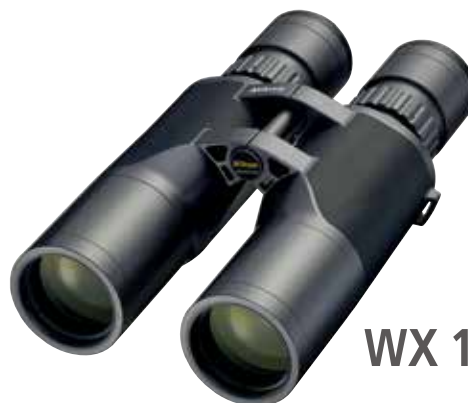
WX 10×50 IF