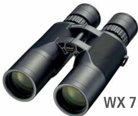
WX 7×50 IF